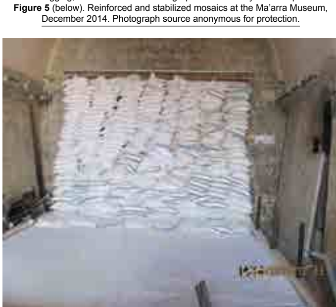
Figure 5 (below). Reinforced and stabilized mosaics at the Ma'arra Museum, December 2014.

out any lasting negative effects to the mosaics.