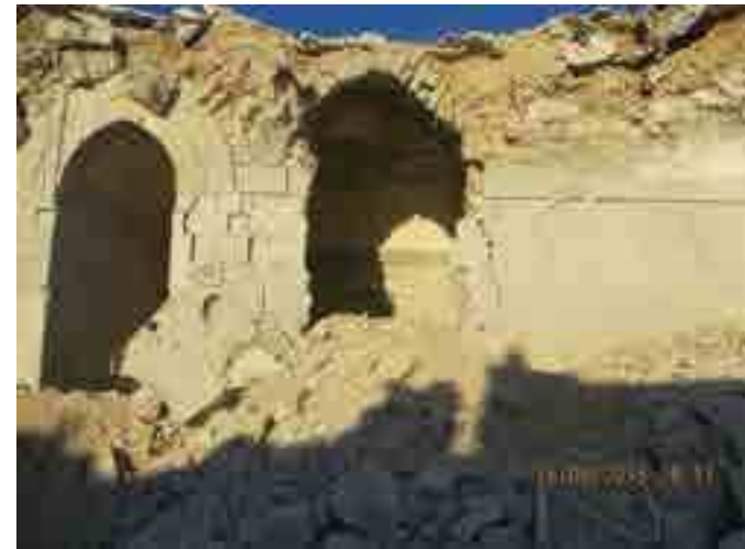
Figure 6 (left). The courtyard of the Ma'arra Museum following the barrel bombing on June 15, 2015.

The SHOSI Project's interventions demonstrate that it is possible to assist heritage professionals caught in a situation such as the present Syrian and Iraqi conflict. Doing so requires the full, collaborative involvement of local Syrians and Iraqis, who are