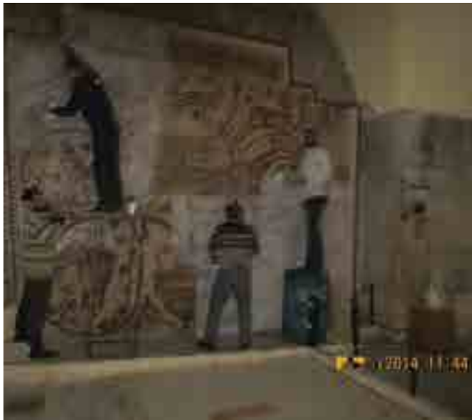
Figure 4 (above). The Ma'arra Museum's curatorial staff preparing the mosaics for sandbagging, December 2014.

Following the Gaziantep workshop, the museum's curatorial staff developed a plan to protect the building and mosaic collection in situ, which was further developed by international conservation specialists at the Smithsonian and other organizations. The conservation work began at the museum in October 2014, and was carried out by an in-country team of heritage professionals, which included the museum's staff, archaeologists, and civil society activists from the area. At first, all holes in the roof were cleaned and then filled with bars and cement. Collapsing arches in the caravansary's courtyard were also repaired using local stone in order to match the original building materials. After these basic efforts to shore up the building, the team addressed the mosaic collection. The team first cleaned any accumulated dust from the mosaics, and then applied a layer of water-soluble glue followed by flashspun polyethylene fiber or cotton cloth to fortify and keep the tesserae together (fig. 4). Sandbags were then stacked alongside the mosaics to offer additional blast protection and to minimize potential damage in case of a wall-collapse or shrapnel fire. Altogether, some 1,600 square feet of mosaics were protected in this manner (fig. 5). All the materials involved in this emergency project can also be cleaned or removed easily with-