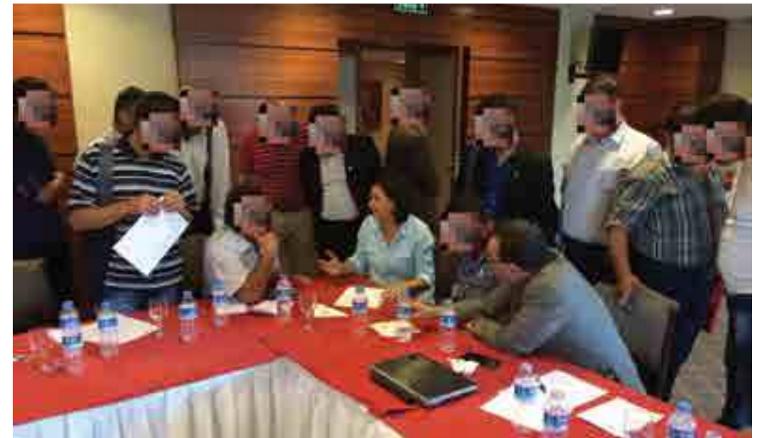
Figure 1. Attendees at the 2014 Emergency Care for Syrian Museum Collections course in Gaziantep, Turkey, discuss at-risk collections.

In spring 2013, as the Syrian crisis began to worsen, the Smithsonian Institution convened a meeting to discuss potential interventions that could protect Syria's cultural heritage. The Safeguarding the Heritage of Syria Initiative, also known as SHOSI, developed following this meeting. SHOSI began with the Penn Cultural Heritage Center at the University of Pennsylvania Museum; the Office of the Under Secretary for History, Art, and Culture at the Smithsonian Institution; the Geospatial Technolo-