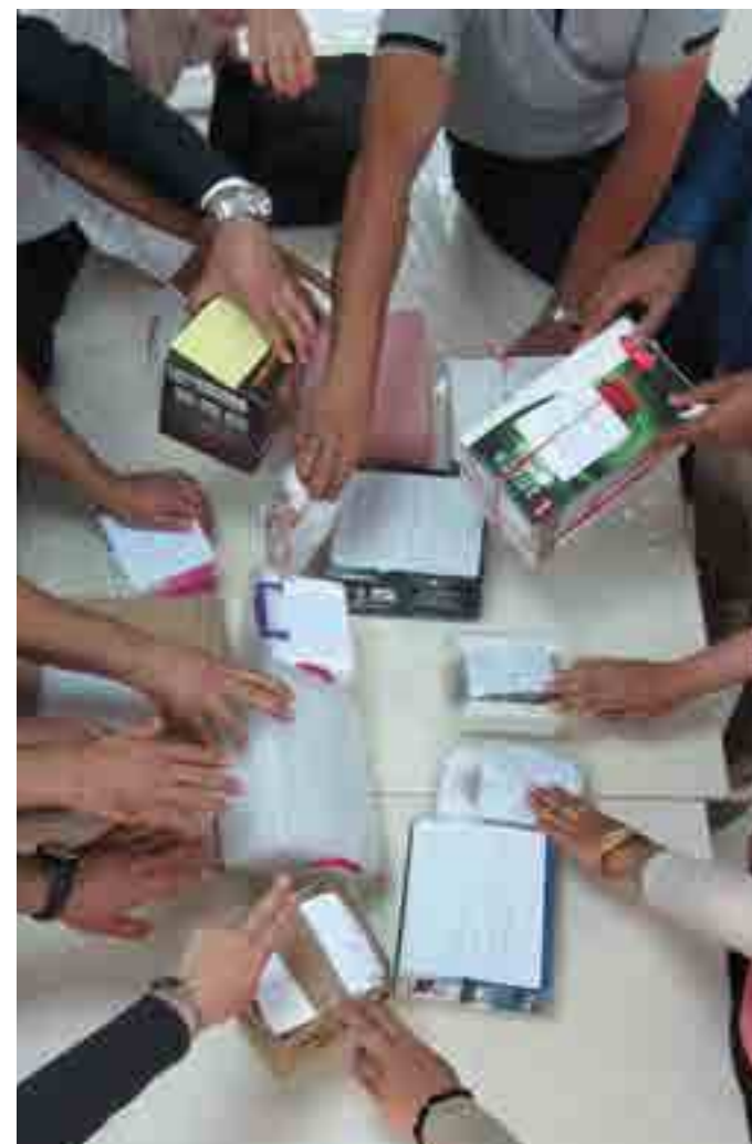
Figure 3. Iraqi heritage professionals holding the results of their assignment to pack an artifact using only material from their dorm rooms.

Following complex emergencies, the international heritage community has often responded by offering training programs for the impacted country's heritage professionals. It is therefore no surprise that emergency workshops have been the front-